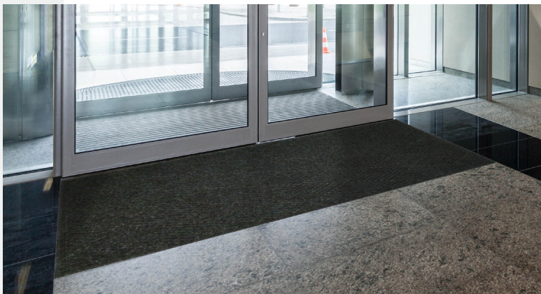
Classic Rubber Border